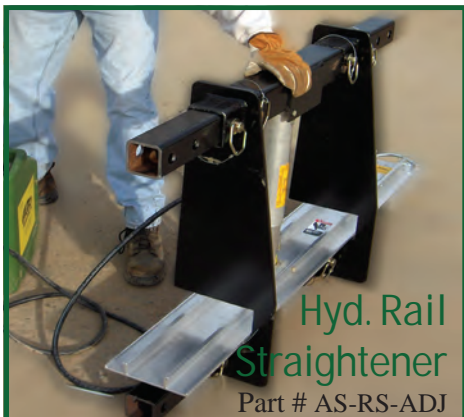
Hyd. Rail Straightener