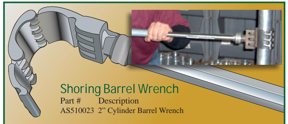
Shoring Barrel Wrench