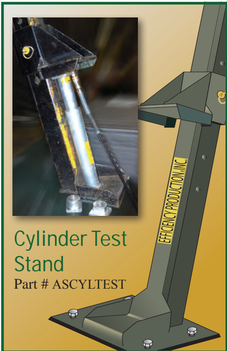
Cylinder Test Stand